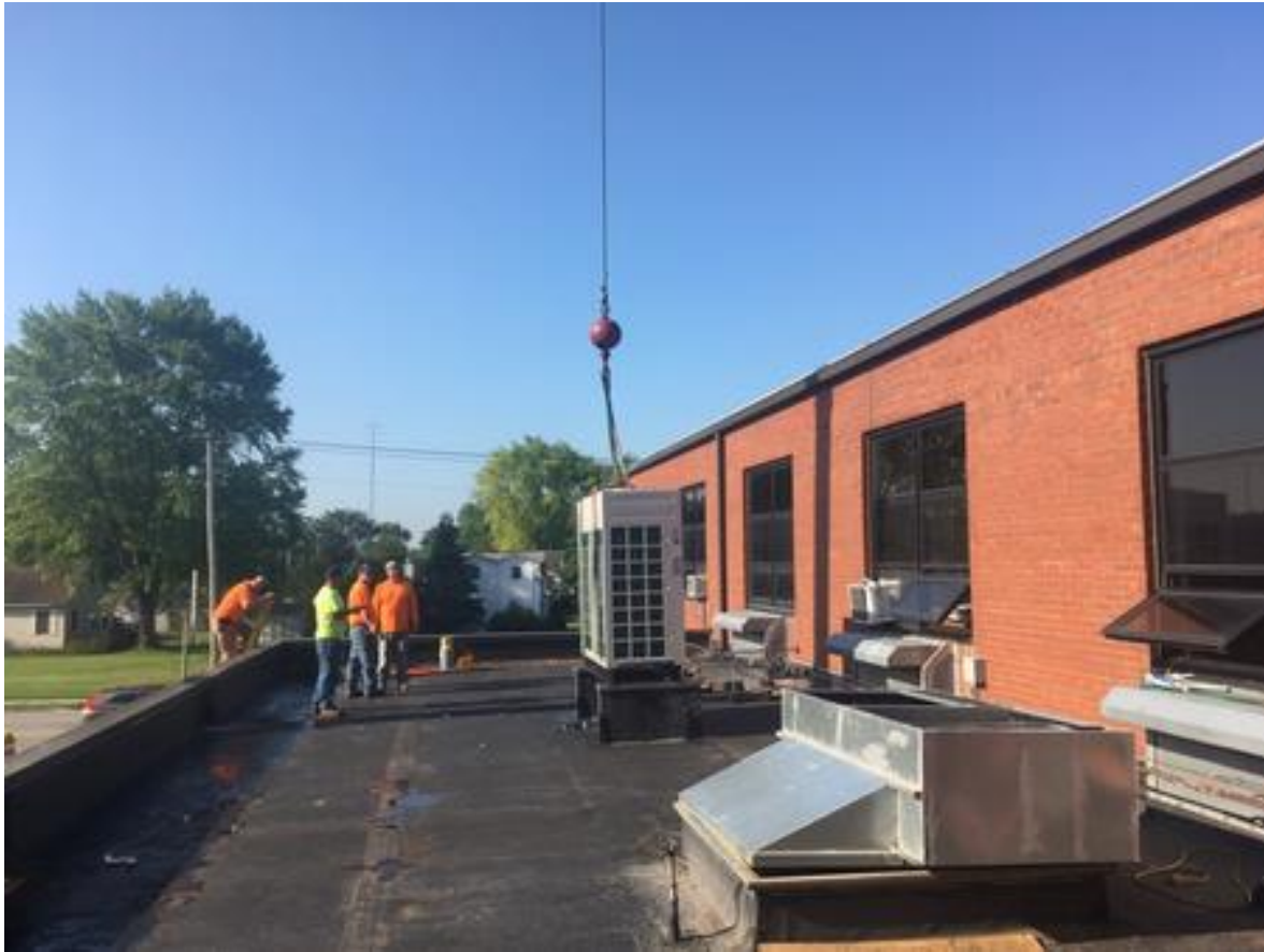
New HVAC Equipment