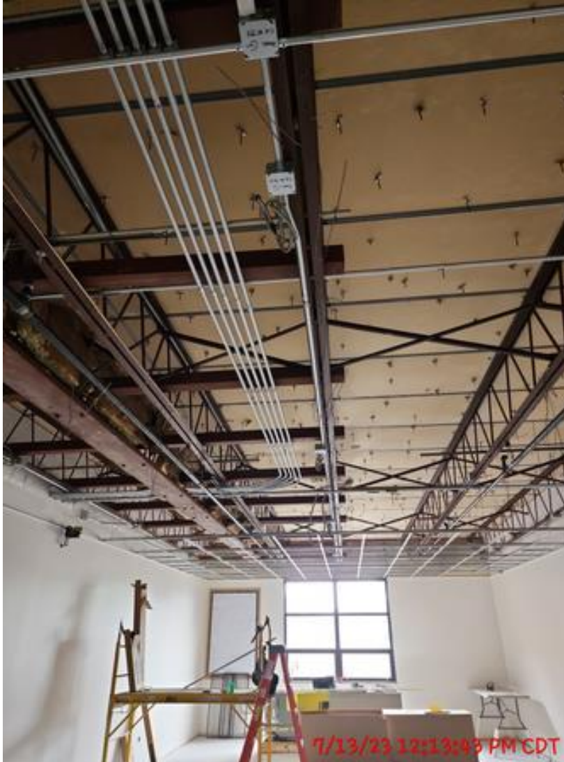
MEP Above Ceiling Rough