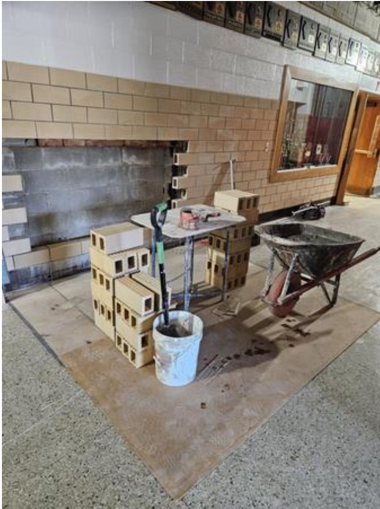
Patching Unit Heater Wall Opening