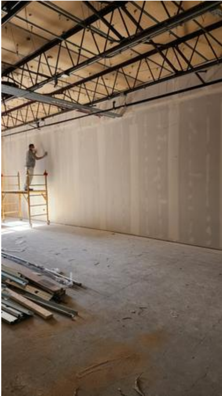
Drywall finishing at Classroom