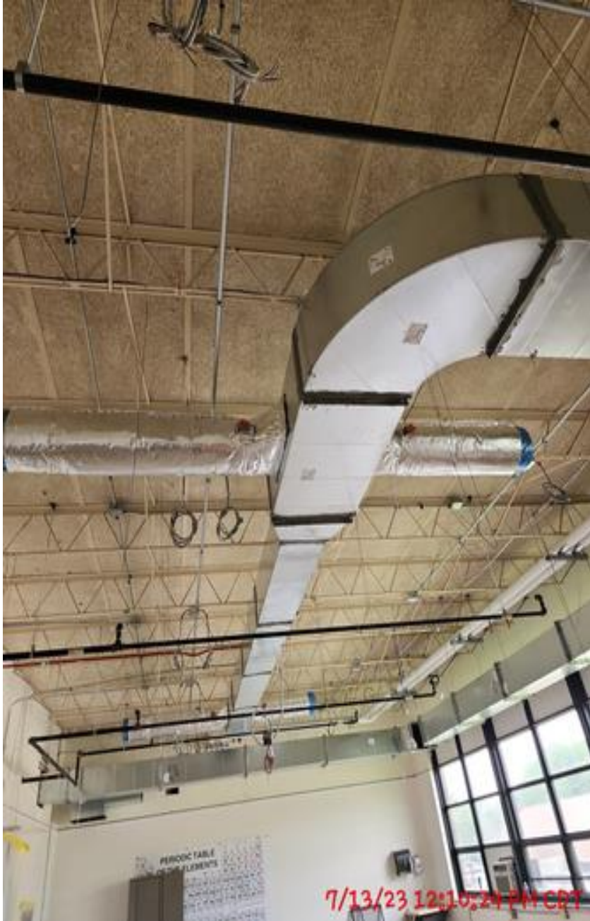
Ductwork In Classroom